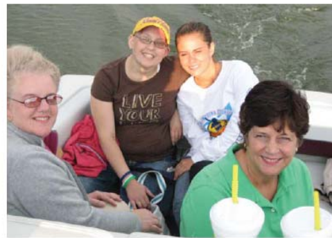
Yachts of Fun