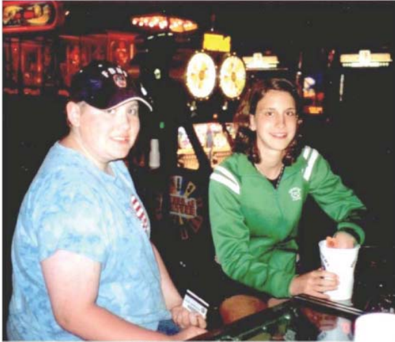
Dave & Busters Party